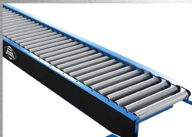
Poly V Motorised Conveyor