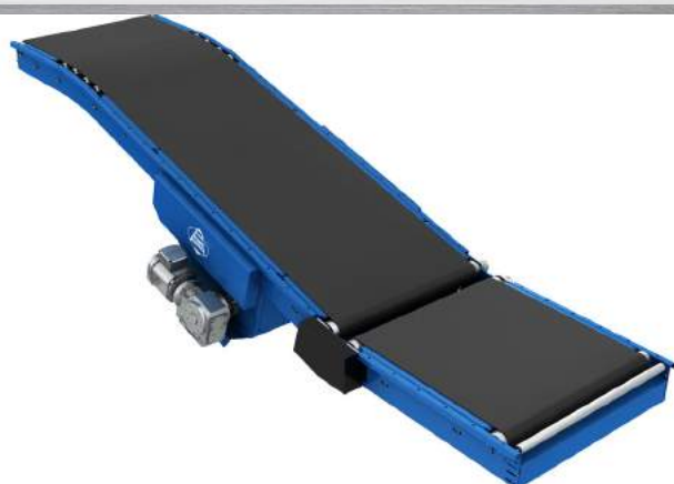
Post & Parcel Belt Conveyor